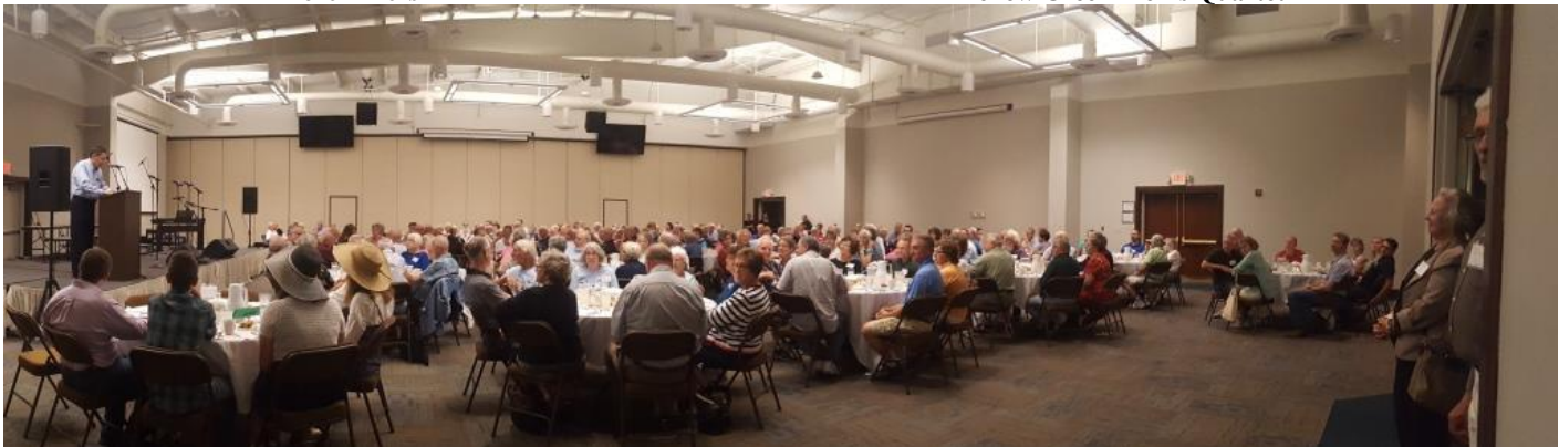
A Banquet Panorama