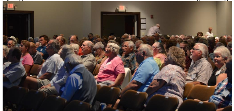
The Saturday audience at the Shipshewana Event Center