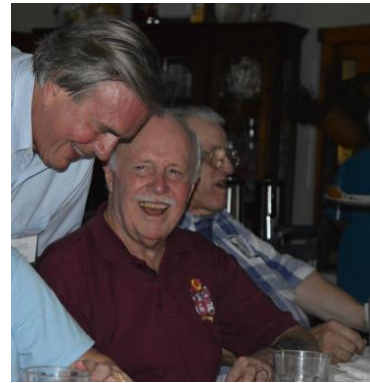
Plenty to Eat!