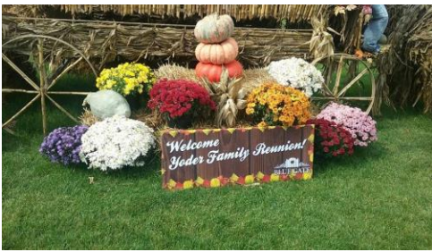
Welcome to Shipshewana