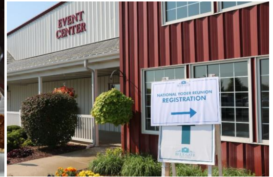
The Event Center