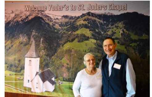
A Visit to the St. Joder Chapel