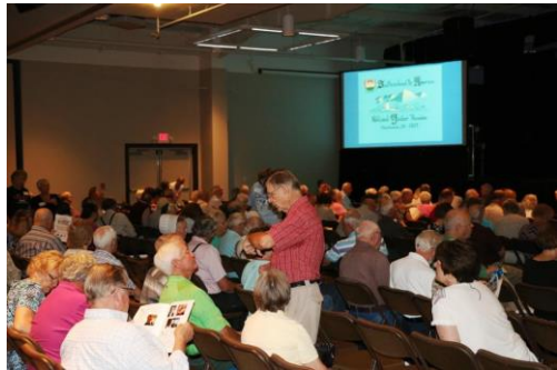
More of the Audience