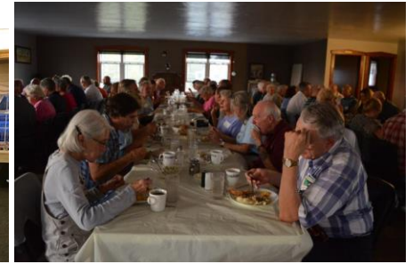
Amish Home Dinner