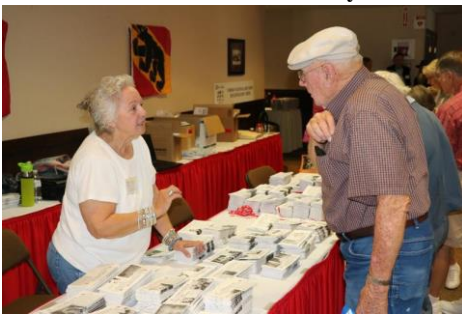
Registration Table